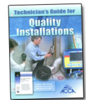
Another useful resource for understanding QI. Check it out.

Don't just read them, use them! Get training and prove you follow the indoor environment industry's best practices by becoming QA accredited .